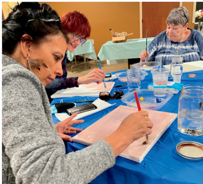
LEARNING & GROWING

As a small church in Indiana, you might think that our ability to love is limited to our local community. And yet, we are finding ways to support the work of the Church on a global scale.